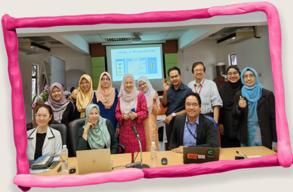
UUM researchers attending progress coordination workshop.