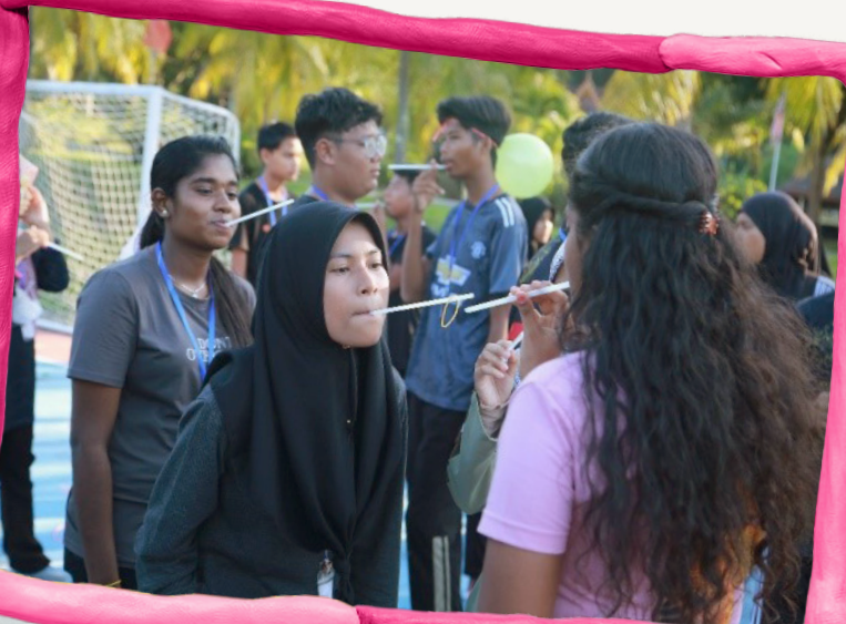
KOMPas YSD engagement and mentoring sessions with 180 identified students.