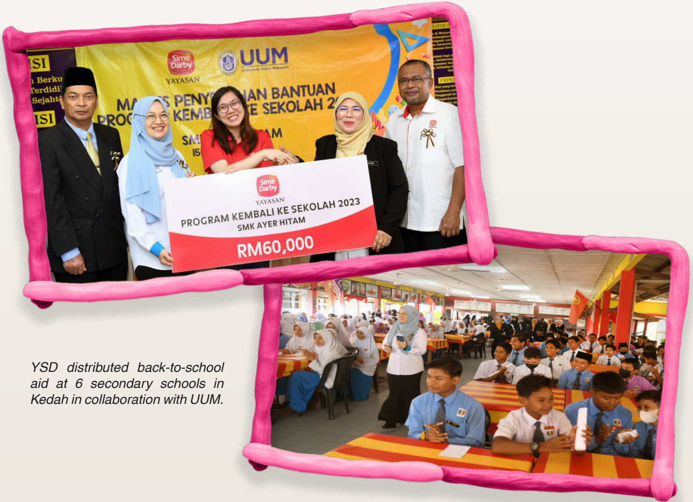
YSD distributed back-to-school aid at 6 secondary schools in Kedah in collaboration with UUM.