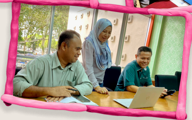
KOMPAS YSD Engagement Session on 12 March 2023 at Kedah State Education Department office.